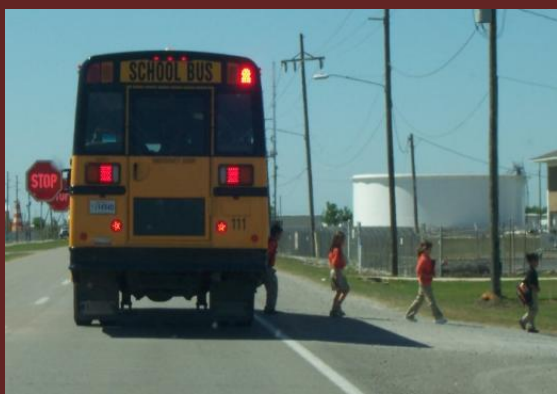
(above) School bus drops off students after school.